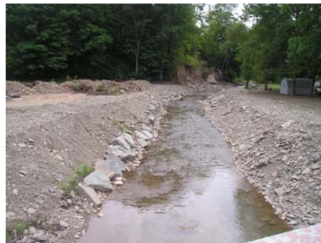
Cadosia Creek, showing the affects of a "debris removal" project.

Keep tuned to our website for actions you will be able to take to help stop these damaging and counterproductive practices.