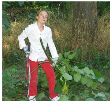
A volunteer removes Japanese knotweed.

Recently, our volunteers helped control plant invaders threatening the riparian corridors of our local streams. Japanese knotweed, Asiatic bittersweet and Japanese hops were cut down and bagged to make room for native plants. Special thanks go out to Temple University, Gamma Iota Sigma-Sigma Chapter, #623 Rainbow Hollow Girl Scouts, and Wendy Lathrop for all of their help and hard work.