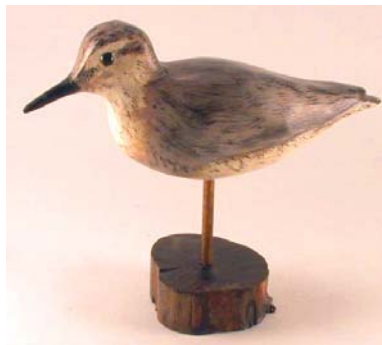
Red knot carving by craft show exhibitor Ron Dombrowski.