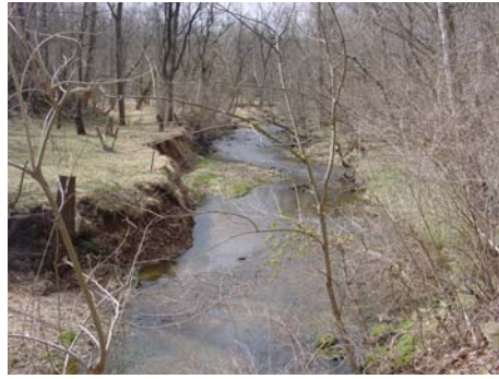
Valley Creek banks before re-grading.