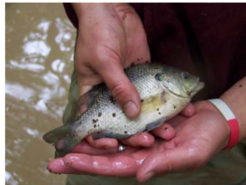
One that will survive for another day.