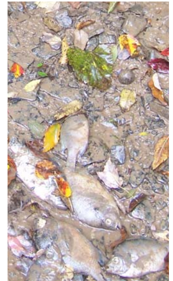
Fish caught in the sediments in Robin Run.