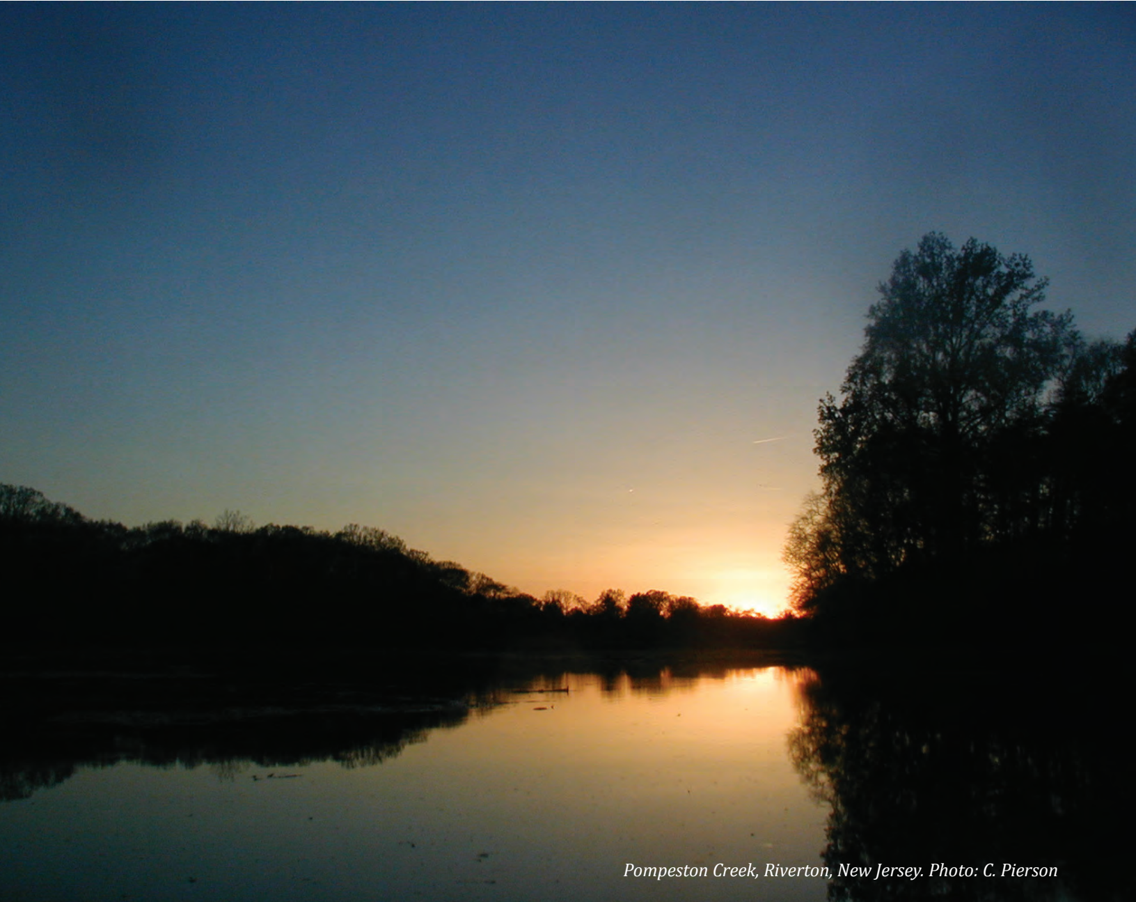
Pompeston Creek, Riverton, New Jersey.

Delaware Riverkeeper Network 925 Canal Street, Suite 3701 Bristol, PA 19007 215-369-1188 www.delawareriverkeeper.org