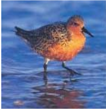
Red knot.

The Delaware Riverkeeper Network is working as part of a coalition to protect the red knot, a migratory shorebird. The red knot, Calidris canutus , undertakes one of the longest journeys of any migratory shorebird. Every spring, red knots fly from the southern most tip of South America at Terra del Fuego to their breeding grounds in the