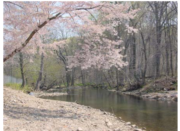
Darby Creek in Lansdowne, PA.

This summer, DRN is working with the Friends of the John Heinz National Wildlife Refuge and the