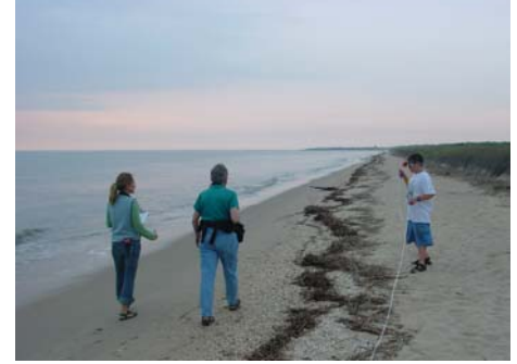
Volunteers search NJ beaches.

New Jersey Acting Governor Codey issued an Emergency Rule, effective June 9th, suspending