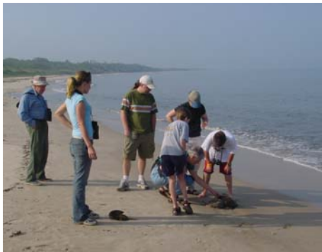
Volunteers monitor horseshoe crabs.

Horseshoe crab numbers have steadily declined over the last 15 years due to over-harvesting by bait