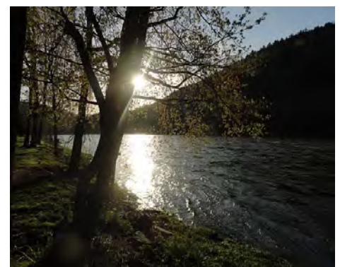
Along the Upper Delaware River