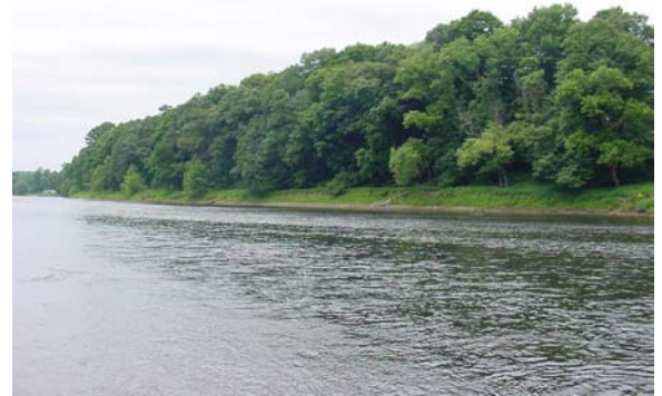
Depue Island, River Mile 251 in the Delaware Water Gap National Recreation Area, Middle Delaware Scenic and Recreational River.

Although no plans have been filed, efforts to build a hotel and conference center continue to threaten Depue Island (see River Rapids, Winter '04 ). Located in the Delaware Water Gap National Recreation Area (DWGNRA) and the Middle Delaware Scenic and Recreational River in Smithfield Township, Monroe County, PA, Depue Island is just across from NJ's Worthington State Forest. The island, over 160 acres of naturally wooded floodplain, supports woodland plants, grasses, mature trees, and endangered and threatened species. Bald eagles call the island home. Its gravel bars provide the perfect habitat for the federally endangered dwarf wedgemussel, Alasmidonta heterodon .