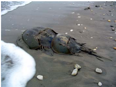
Horseshoe crabs, Limulus polyphemus, on Broadkill Beach, DE.