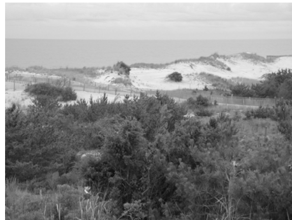
The dunes at Cape Henlopen, DE.

Spend a day where the Delaware Bay meets the Atlantic Ocean.