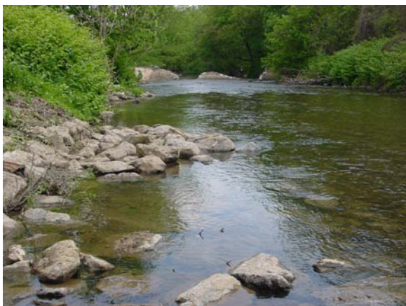
Darby Creek rock deflector (foreground) and W-weir (background).

John Bartram Memorial Park now provides a new opportunity for Darby area families to re-connect with nature along a beautiful section of Darby Creek. For more information about this project, contact dan@delawareriverkeeper.org .