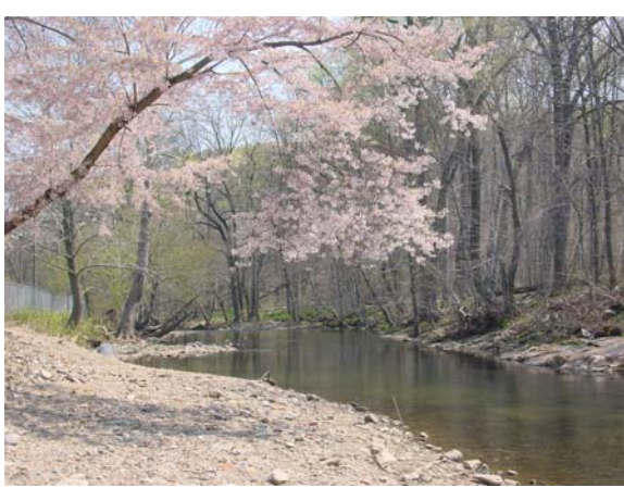
Darby Creek in Lansdowne, PA.

U.S. Fish and Wildlife Service to begin developing a restoration plan for the Heinz Refuge and the Lower Darby Creek. The project, funded through the National Fish and Wildlife Foundation, will review the historic and existing conditions of the Lower Darby and develop recommendations for future restoration needs. The restoration plan will likely include recommendations related to invasive species control, stream stability, and freshwater tidal marsh restoration.