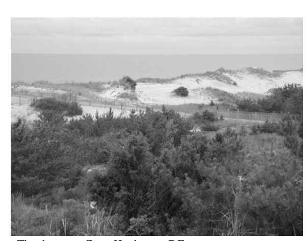
The dunes at Cape Henlopen, DE.

Spend a day where the Delaware Bay meets the Atlantic Ocean.