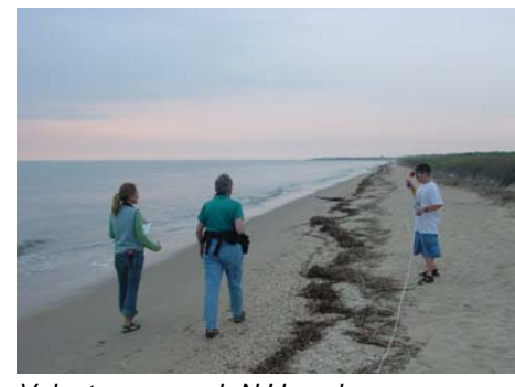
Volunteers search NJ beaches.

horseshoe crab harvesting in the Bay for two weeks, in order to allow the state to consider the recently developed scientific information. However, a permanent moratorium is needed.