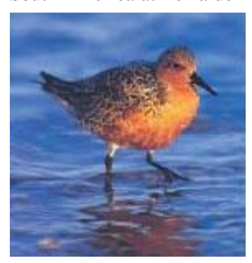
Red knot.

The Delaware Riverkeeper Network is working as part of a coalition to protect the red knot, a migratory shorebird. The red knot, Calidris canutus , undertakes one of the longest journeys of any migratory shorebird. Every spring, red knots fly from the southern most tip of South America at Terra del Fuego to their breeding grounds in the