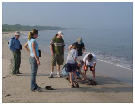
Volunteers monitor horseshoe crabs.

Horseshoe crab numbers have steadily declined over the last 15 years due to over-harvesting by bait