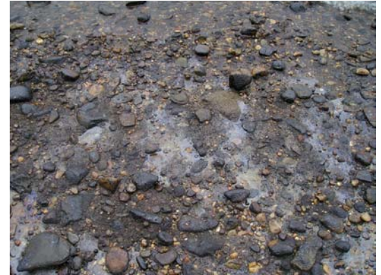
Oil and sheen on beach.

birds able to fly to cleaner locations. Volunteers visiting these areas to perform wildlife surveys have documented oiled birds and alerted the US Fish and Wildlife Service for rescue efforts. Volunteers are also visiting public access areas along tributary streams from the mouth to the head of tide to document the scope, degree, and persistence of oiling over time. DRN is using the data being gathered to compare with aerial flight data, to supplement agency field assessments, and to advocate for and help develop a thorough and extensive Natural Resource Damage Assessment that will hold the tanker owner and operators involved responsible for the irreparable harm being inflicted on the River.