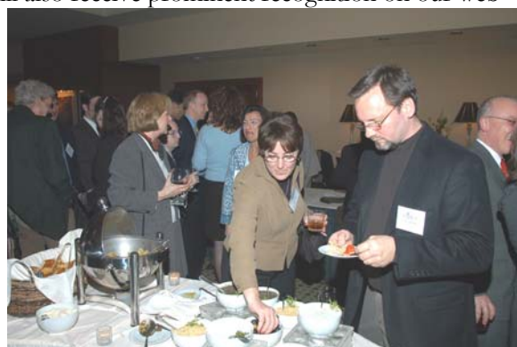
Help celebrate the River & our work on its behalf.