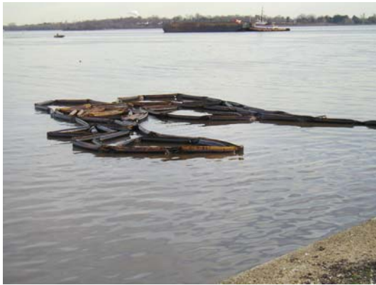
Oiled containment boom.

The Delaware Riverkeeper Network's multi-faceted volunteer monitoring program has been in existence for over a decade. We rely on dedicated and trained volunteer monitors to help us on behalf of the River, so when the Athos I began leaking large amounts of Venezuelan crude from its damaged hull, we knew that a citizen monitoring initiative could serve as our eyes and ears for the River as it suffered the consequences of the spill.