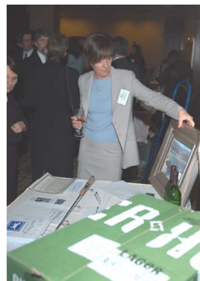
Door Prizes & Silent Auction!