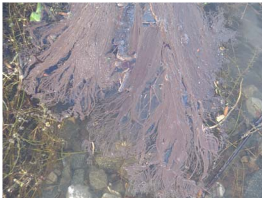
Oil near Little Mantua Creek.

Although booms were removed at the end of the year to allow for flushing of the system, our volunteers continue to track changes over time. Volunteers are documenting locations where oiled debris has been stranded along tributary shorelines at high tide to ensure clean-up crews reach these areas. Those with birding skills are monitoring inland wildlife hotspots located outside of the immediate spill zone that were used as refuges by