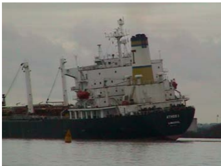
The listing Athos I.

As the oil tanker was maneuvering to come in to the dock, it hit a 15-foot curved hunk of rusting steel resting on the bottom of the River. The iron piping ripped open the bottom of the single-hulled tanker leaving two gashes in the hull: the first, 6-feet by 2 1/2-feet; the second, 2 1/2-feet by 1 1/2-feet. Crude oil began spilling out of the breached hull, quickly covering the River. Soon, birds, other wildlife, and important river and wetland habitats were coated and contaminated by the thick oil.