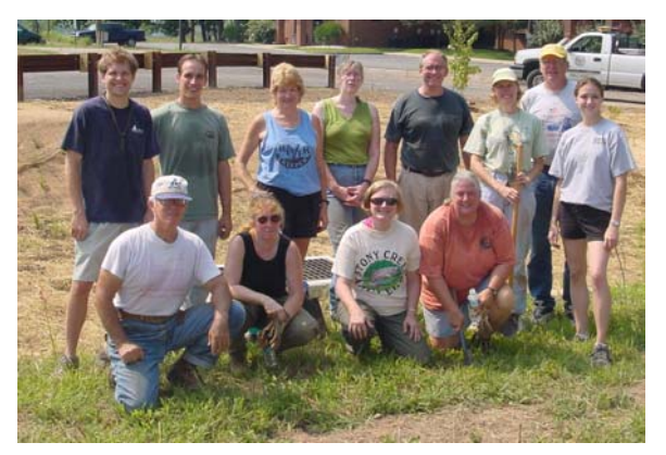
The Black Rock Park stormwater basin naturalization crew.

The basin was planted with native species that reduce pollutants, provide benefits for wildlife and create a more aesthetically interesting place than the barren landscape of a mowed basin. The planting plan included two native seed mixes, plugs of wildflowers and grasses, and