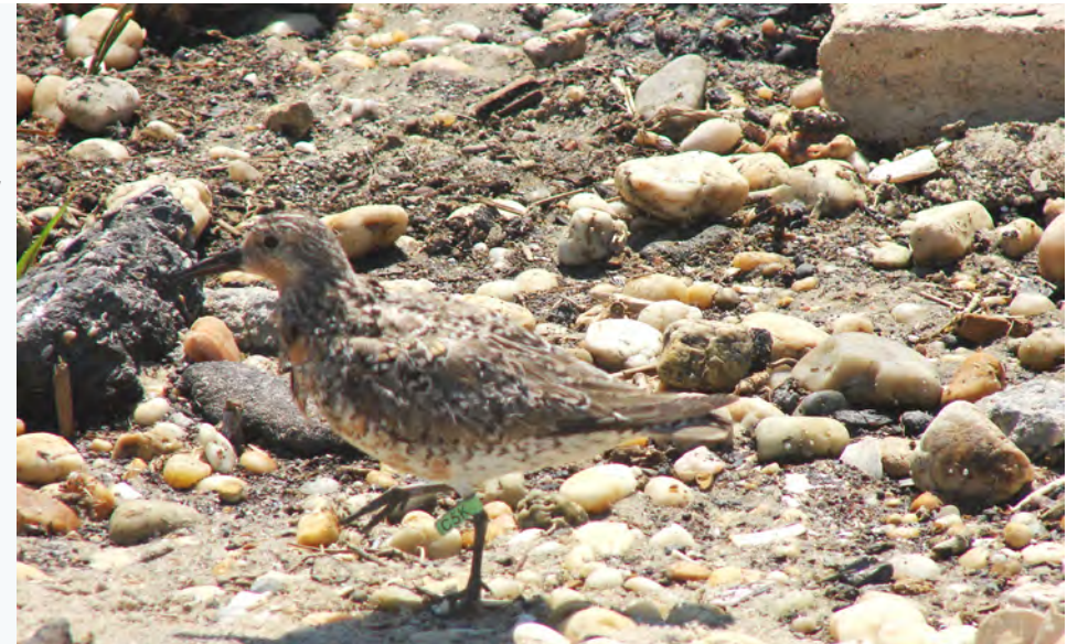
A red knot rifa along the Delaware Bayshore.

Check our website regularly for details on how you can lend your support to the listing of red knots.