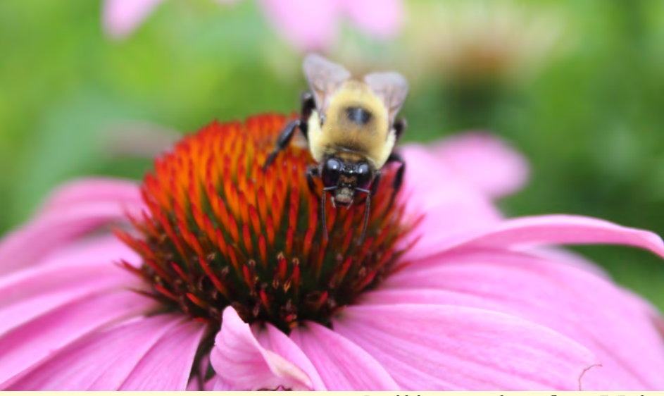
Bumblebee on purple coneflower. F. Zerbe