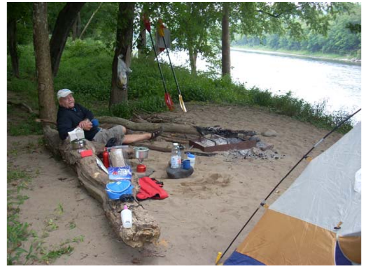
DELAWARE RIVER CAMPSITE ALONG THE DELAWARE. THE NATIONAL PARK SERVICE HAS CREATED FIRST COME FIRST SERVE CAMSITES THROUGHOUT MANY OF THEIR PARKS FOR HIKERS AND BOATERS TOO REST.

Campgrounds along the Delaware River provide access to river resources and recreation including rafting, canoeing, kayaking, fishing and wildlife viewing. Natural, low impact campgrounds retain the atmosphere and essence of nature that campers seek. Campgrounds throughout the watershed range in size and amenities, and are an important part of the ecotourism experience. RV campsites generally have hook ups to electricity, increasing the amount of amenities campers have while enjoying the outdoors. For example, Lander's River Trips Campground has four different campgrounds to choose from, allowing for all types of campers. Some enjoy the peaceful quiet sounds by the campfire, while others want restaurants and amenities after a long day on River. Dingmans and Kittatinny camparounds both offer whitewater rapids