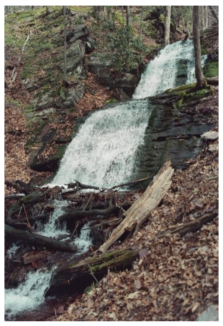
WORTHINGTON STATE FOREST, NJ WATERFALL ON A TRIBUTARY TO THE MIDDLE DELAWARE WILD AND SCENIC RIVER.