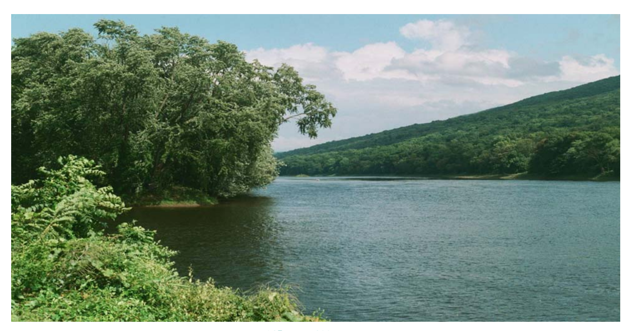
DEPUE ISLAND IN THE DELAWARE WATER GAP, RIVER MILE 215. OVER 100 ISLANDS EXIST IN THE DELAWARE, SOME DEVELOPED AS GOLF COURSES, ONE AS A BOY SCOUT CAMP, BUT MOST ARE UNDEVELOPED FORESTS AND HABITAT PERFECT FOR A LUNCH BREAK STOP DURING A PADDLE.