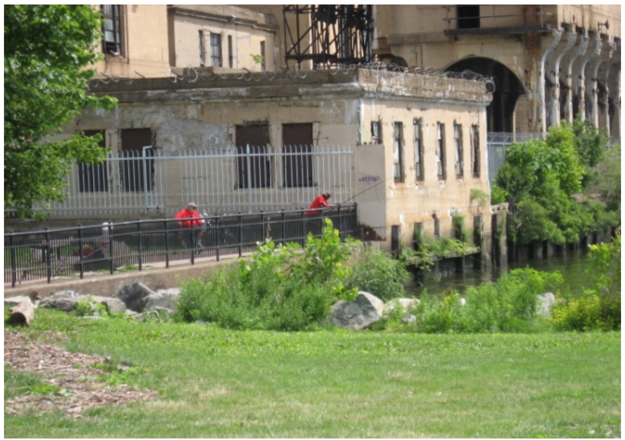
PHILADELPHIA, PA URBAN FISHERMAN OUTSIDE OF VACANT PHILADELPHIA ELECTRIC COMPANY ON DELAWARE AVE AT PENN TREATY PARK. FISHERMAN CAN ALMOST ALWAYS BE FOUND AT THIS SPOT.