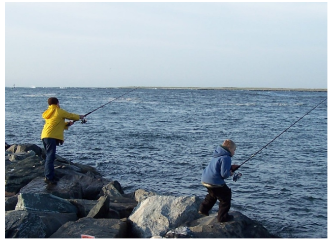
DELAWARE BAY, DE THESE ROCKY OUTCROPS JUTTING INTO THE BAY MAKE A PERFECT FISHING PLATFORM FOR KIDS AND ADULTS WANTING TO CATCH SOME FISH FOR DINNER OR JUST HAVE SOME FUN.

Urban anglers use spots like naturalized piers and docks throughout Philadelphia, as well as urban parks and bridges to go fishing on both the Delaware and its major tributary there, the Schulykill. Greenways along major roadways and new parks in urban areas like Trenton attract anglers providing them with a relatively inexpensive meal each trip. (see "FISH ADVISORIES" box)