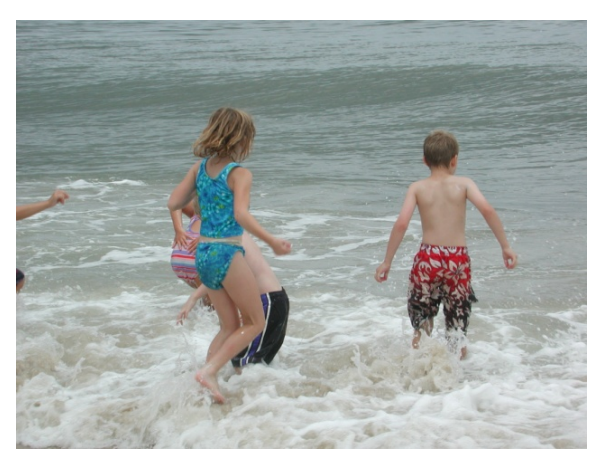
CAPE HENLOPEN, DE KIDS SWIMMING DURING DELAWARE RIVERKEEPER NETWORK'S ANNUAL MEMBERS DAY AT THE BAY DAY AT THE BEACH. THE BAY OFFERS MORE SECLUSION THAN THE JERSEY SHORE. WITH JUST AS MUCH FUN.

The Delaware is a safe and fun haven for swimmers and the canal towpaths create perfect biking trails. Swimmers enjoy Delaware River and tributary waters at a number of locations that may not be official access points, but community-made put-ins where kids and adults can appreciate the cool water during the hot summer.