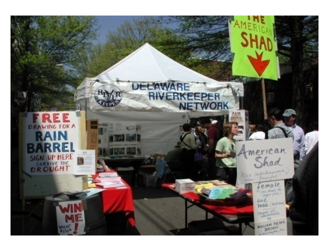
LAMBERTVILLE, NJ DELAWARE RIVERKEEPER NETWORK BOOTH FEATURING A REAL AMERICAN SHAD, MERCHANDISE, AND EDUCATIONAL MATERIAL.

The American Shad are celebrated in several cities throughout the watershed during their spring spawn including Fishtown in Philadelphia, Easton, Pennsylvania and Lambertville, New Jersey bringing in people from all over the basin. The annual Shad fishing tournament held each year following the Easton Shadfest charges a $20 entry fee, and with over 1000 competitors in 2006, the tournament raised $20,000 in proceeds. Lambertville's Shadfest has been an annual part of the community for 26 years, attracting 30,000 to 35,000 visitors during the two day event. The Shad population has rebounded from decades ago because of renewed efforts to maintain water quality allowing the Shad to make the spawning journey up the Delaware.