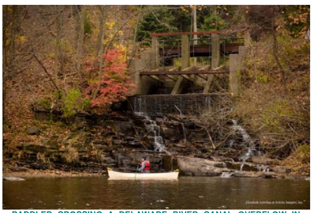
PADDLER CROSSING A DELAWARE RIVER CANAL OVERFLOW IN SMITHFIELD, PA ON THE DELAWARE RIVERKEEPER NETWORK'S NOVEMBER 2008 BUSINESSMAN'S CANOE TRIP.

On the Delaware River recreational possibilities abound and include all types of boating, fishing, bird watching, hiking, biking, tubing, jogging, swimming, camping, and wildlife viewing. Keeping the river healthy, and restoring health where it has been lost, will allow these recreational activities to prosper.