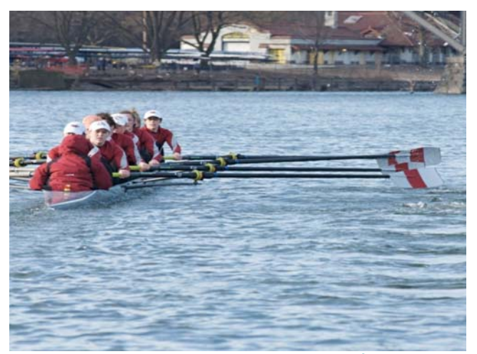
PHILADELPHIA, PA ST. JOSEPH UNIVERSITY WOMEN'S ROW TEAM SCHUYLKILL RIVER. ROWING HAS A LONG HISTORY ON THE MAIN STEM SCHUYLKILL RIVER.

The presence of the Schuylkill Navy and the clubs along Boathouse Row nurtured excellence in amateur rowing for decades. Vesper Boat club, organized in 1865, won gold medals in the eight-oared shell event at the 1900, 1904 and 1964 Olympics.<sup>83</sup>