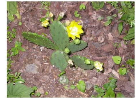
PRICKLY PEAR CACTUS IN BLOOM IN NEW JERSEY. THE CACTUS CAN BE FOUND THROUGHOUT THE DELAWARE RIVER WATERSHED FROM THE PINES BARRENS TO THE JOHN HEINZ WILDLIFE NATIONAL REFUGE TO CLIFFS ALONG THE UPPER REACHES OF THE RIVER.

River Values: The Value of a Clean and Healthy Delaware River