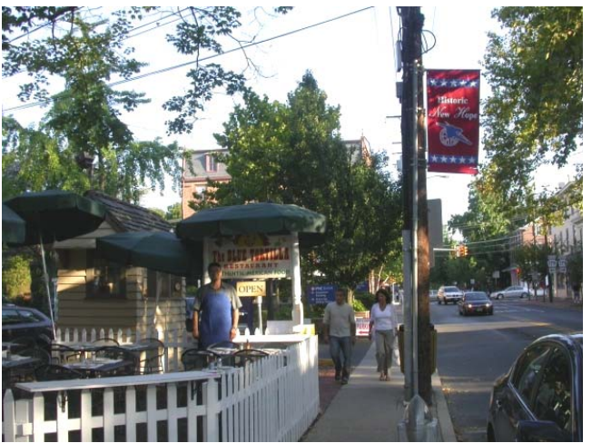
BLUE TORTILLA RESTAURANT IN NEW HOPE, PA THE HISTORIC BUILDINGS, PEDESTRIAN FRIENDLY WALKWAYS, AND RIVERFRONT ACCESS ALL BRING TOURISTS TO THE AREA FOR SHOPPING, DINING, AND RECREATION.

The State of Delaware has attracted tourists through creative activities such as the "Biking Inn to Inn" – an excursion that combines recreation, wildlife viewing, exercise, and Delaware's history on a 30-45 mile biking tour. 243 The trip stops at three different historic Delaware Bed and Breakfasts along countryside