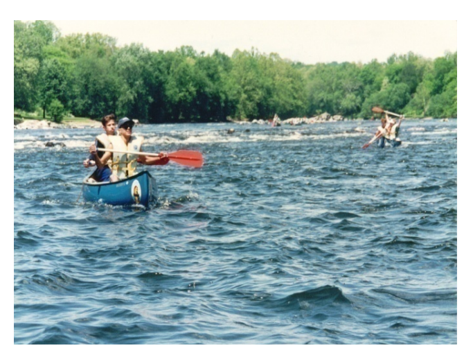
CANOEING AT THE DELAWARE WATER GAP. THE WATER IS CLEAN, THE AIR IS FRESH, AND CLIFFS APPEAR THROUGHOUT THE LANDSCAPE. WILDLIFE IS ABUNDANT THROUGHOUT THIS STRETCH MAKING IT THE PERFECT OUTDOOR EXPERIENCE FOR PEOPLE FROM NEW YORK, PHILADELPHIA, AND BEYOND.

In 2007, in recognition of the beauty of the DWGNRA and its 40.6 mile water trail, the Delaware Water Gap National Recreation Area was designated a National Recreation Trail by the Secretary of the Interior. The trail is valued for connecting people with the beauty and values of nature, introducing them to geological formations and a diverse set of wildlife habitats. It is the largest recreation area in the eastern U.S. bringing in revenue to local communities and economies in both Pennsylvania and New Jersey. The secretarion area in the eastern U.S. bringing in revenue to local communities and economies in both Pennsylvania and New Jersey.