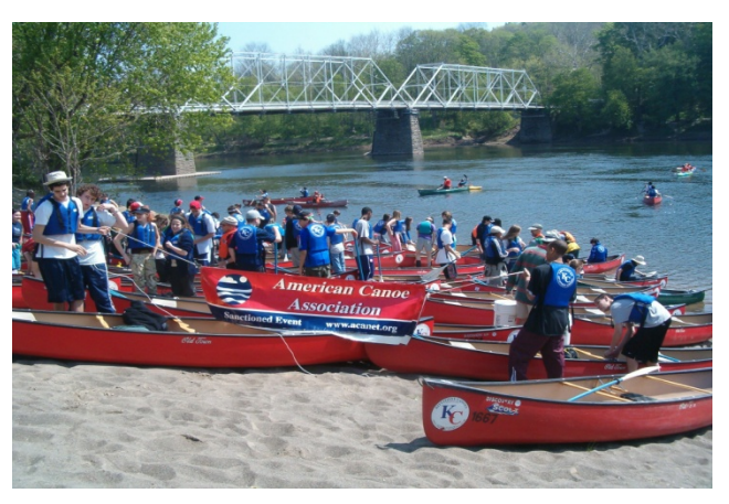
DINGMANS FERRY, PA AMERICAN CANOE ASSOCIATION HELPING DRN ORGANIZE THE ANNUAL UNITED NATIONS INTERNATIONAL SCHOOL FRESHMAN CLASS CANOE AND CAMPING TRIP ON THE DELAWARE.

Today, the Schuylkill Navy is the oldest amateur athletic governing body in the United States and is made up of ten clubs on Boathouse Row as well as high school and college rowing programs. In 1938, Philadelphia Girls' Rowing Club, the first boat club on the Schuylkill for women, was organized. The first Schuylkill men's club to organize a women's rowing team was Vesper in 1970. Page 2019.