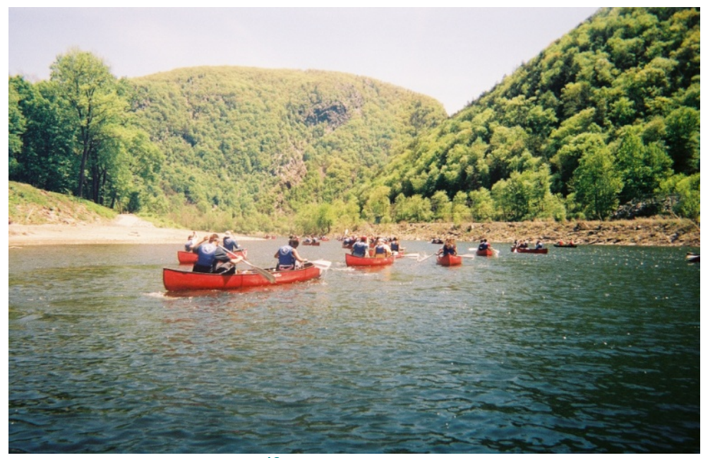
DELAWARE WATERGAP FOR THE PAST 18 YEARS, DELAWARE RIVERKEEPER NETWORK HAS ORGANIZED A 3 DAY CANOE AND CAMPING TRIP FOR THE FRESHMAN CLASS OF THE UNITED NATIONS INTERNATIONAL SCHOOL FROM NYC. FOR MANY IN THE GROUP OF 100+, IT IS THEIR FIRST TIME IN A CANOE OR CAMPING IN THE WOODS.

Keeping the riversides and a campgrounds clean are important in attracting tourists to the region. Recognizing this Kittatinny Canoes near the Delaware Water Gap National Recreation Area hosts an annual river litter clean up that brings in people from all over the watershed to pull tires, paper, plastic bottles, and roadway trash from the River.