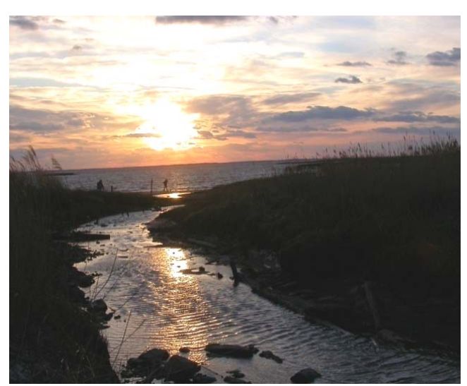
CAPE HENLOPEN STATE PARK DELAWARE BAY AT SUNSET. VISITORS CAN CAMP ON THE BEACH AND WATCH WATERFOWL WHILE THE SLIN SETS

The State of Delaware is home to 18 parks including historical parks, nature preserves, state forests, and scenic vistas.<sup>222</sup> Delaware is known for its unmatched wading populations. Marshes, wetlands, and the Delaware River estuary provide habitat to rare bird species specific to the Delaware region.<sup>223</sup> Delaware visitors can experience beaches, rivers, nature trails, greenways, and farms. State parks in Delaware include activities such as whale and dolphin watching. 224 Cape Henlopen State Park, which borders the Delaware Bay, allows visitors to camp on its beaches and visit the nature center which provides activities year round.<sup>225</sup> Each year Delaware's Cape Henlopen attracts over 1 million visitors.2