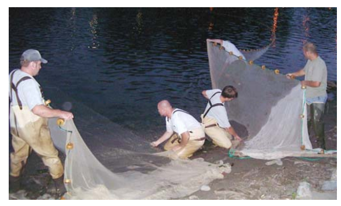
JUVENILE SHAD SEINING.

The American Shad is deeply rooted in the foundation of the cities and towns throughout the Delaware River watershed. The Shad is a "major part of the river's ecology and has played an important role in the river's early commercialization, development, and tourism." American Shad are born in freshwater. After hatching in spring, they feed on plankton and aquatic insects before migrating towards the ocean. After four to seven years in the ocean the Shad return to their place of birth to spawn in the fresh waters of the Delaware River and upriver tributaries.