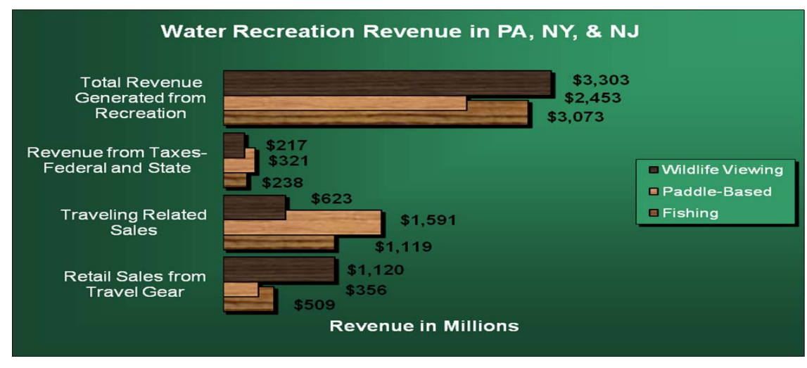
Figure 2 Water Recreation Revenue in PA, NY, & NJ

These national trends and figures are consistent in the Delaware Valley. According to the New Jersey Department of Fish and Wildlife, New Jersey state parks received 12 million visits in one year (1994) statewide, with wildlife recreation, fishing and hunting responsible for 75,000 jobs and generating $5 billion in retail sales. Valley Forge Historical Park, through which the Schuylkill River and tributary streams flow, created 1.23 million recreation visits in 2001 with park visitors spending "$33.3 million dollars within an hour's driving distance of the park, generating $10.4 million in direct personal income (wages and salaries) for local residents and supporting 713 jobs in the area."