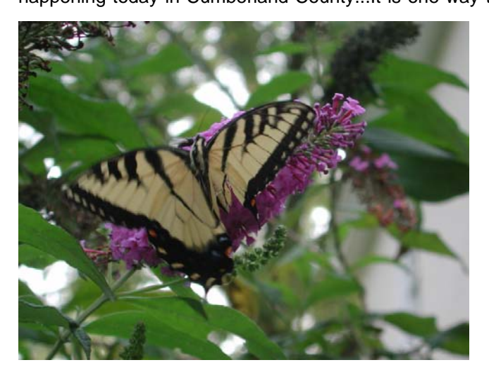
WASHINGTON CROSSING STATE PARK. PA. ECOTOURISM, SUCH AS WILDLIFE OBSERVATION INCLUDING THIS EASTERN TIGER SWALLOWTAIL BUTTERFLY. BRING ECOTOURISTS INTO A REGION REQUIRING MASSIVE INFRASTRUCTURE, ROAD BUILDING, OR HIGH RISE HOTELS. THE KEY IS PROPERLY MARKETING THE UNIQUE AND VALUABLE NATURAL RESOURCES AN AREA ALREADY CONTAINS.

Maintaining the nature and history of towns along the Delaware River makes them tourist locations that bring in additional revenue for the entire community. This idea is what led to Cumberland County New Jersey publishing a "Vision & Implementation Strategy for Economic Development & Conservation" in 1996. The report "was born out of a need to find a common agenda; one that would provide both economic development opportunities and preserve the County's natural heritage. Eco-tourism is here. It is happening today in Cumberland County...It is one way to expand the economy, create jobs, and protect