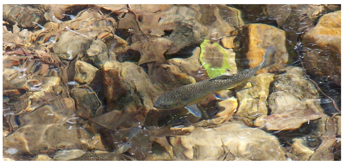
VALLEY CREEK, PA DRN RESTORATION STAFF COME ACROSS BROOK TROUT AND OTHER WILDLIFE WHILE ASSESSING STREAMS AND CONDUCTING RESTORATION PROJECTS.

The Beaverkill and Willowemoc Rivers are credited with providing towns such as Roscoe and Livingston Manor with $10 million in annual expenditures from their sport fishery. Friends of the Upper Delaware have reported that the world famous upper Delaware River is a dynamic tourism and economic engine that has not yet reached its potential. They estimate that fly-fishing in the region could generate $58 million per year in economic activity, creating new jobs with virtually no infrastructure or environmental threat, for which there is already a trained work force and where control would remain local. 134