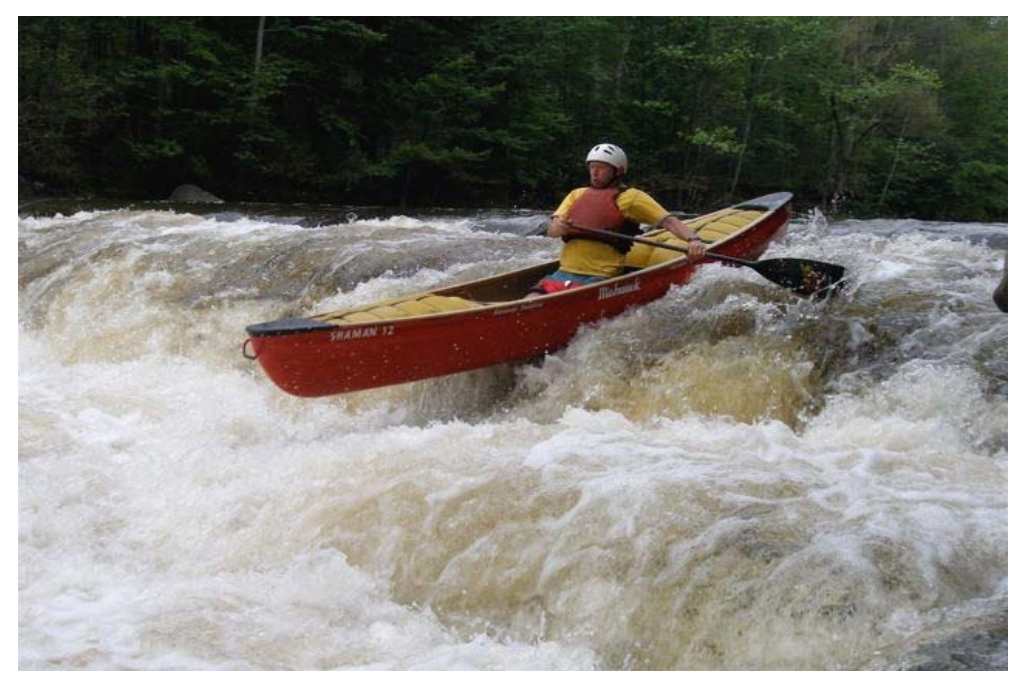
BUCKS COUNTY, PA TWICE A YEAR RELEASES FROM NOCKAMIXON LAKE TO TOHICKON CREEK CREATES A GREAT WHITEWATER EXPERIENCE THAT IS A FAVORITE AMONG WHITEWATER PADDLERS AND CANOEISTS.

Those who enjoy whitewater particularly enjoy the Delaware River's upper reaches. In 1986 the Upper Delaware attracted 232,000 whitewater paddlers who spent $13.3 million, adding $6.2 million to the local economy and supporting 291 jobs. The Water Gap is a tremendous resource for whitewater paddlers. In 1986 this reach of the River was responsible for attracting 135,400 whitewater paddlers who spent $6,929,000, contributing $3,695,200 of local economic value and supporting 156 jobs. The Water Gap is a tremendous resource for whitewater paddlers.