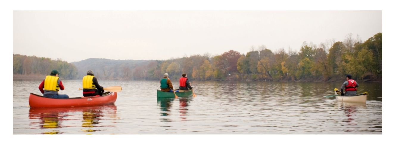
CANOEING THE DELAWARE RIVER AT FRENCHTOWN, NJ DRN HOLDS AN ANNUAL BUSINESSMAN'S CANOE TRIP IN THE FALL FOR MEMBERS AND STAFF TO ENJOY THE RIVER BEFORE WINTER AND WHILE THE LEAVES ARE BRIGHT AND COLORFUL.

According to the Outdoor Industry Foundation, "more Americans paddle (canoe, kayak, raft) than play soccer", and "more Americans camp than play basketball". <sup>66</sup> The U.S. Fish & Wildlife Service reports that in 2006 fishing was the "favorite recreational activity in the United States" with 13% of the population 16 and older (29.9 million anglers) spending an average of 17 days fishing in that year alone. <sup>67</sup> As a result, in 2006, "anglers spent more than $40 billion on trips, equipment, licenses and other items to support their fishing activities." <sup>68</sup> Of this, 44% ($17.8 billion) was spent on items related to their trips, including food, lodging and transportation. <sup>69</sup>