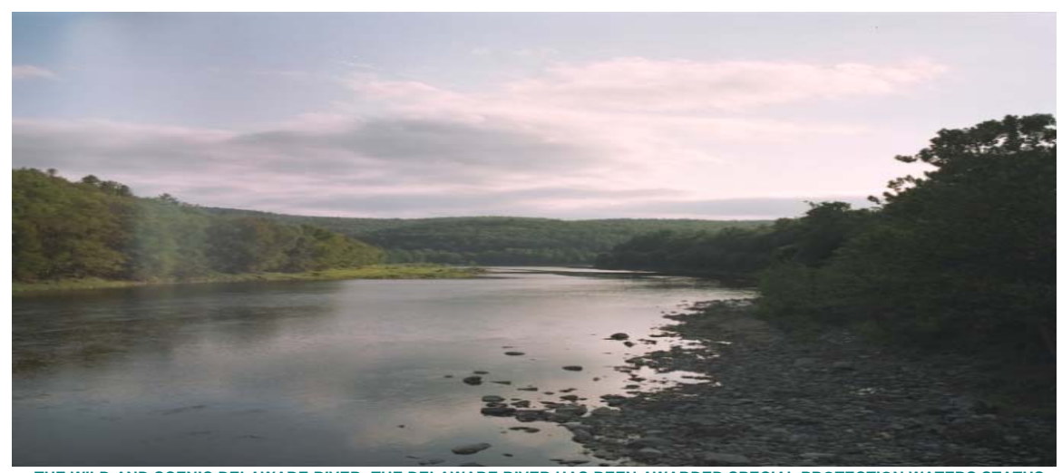
THE WILD AND SCENIC DELAWARE RIVER. THE DELAWARE RIVER HAS BEEN AWARDED SPECIAL PROTECTION WATERS STATUS BY THE DELAWARE RIVER BASIN COMMISSION. THE HIGHEST LEVEL OF PROTECTION FOR BEING A CLEAN AND VALUABLE RIVER FROM ITS HEADWATERS THROUGH THE WATER GAP AND BELOW FOR 176 MILES. NO OTHER RIVER IN THE U.S. HAS THIS DESIGNATION FOR A LONGER STRETCH.

The Delaware Water Gap National Recreation Area is 67,000 acres and was first acquired by the U.S. Army Corps of Engineers in the 1950's to support construction of the Tocks Island Dam. <sup>188</sup> The dam proposal was defeated after decades of protest and analysis. <sup>189</sup> The land was then transformed into a national recreation area which contains waterfalls, ponds, mountains, river bends, and animals such as Bald Eagles, Black Bears, Timber Rattlesnakes, and Peregrine Falcons. <sup>190</sup> There are a variety of plant species present including Hemlock, Rhododendron, Andropogon gerardii (big bluestem grass) and Prickly Pear Cactus. Water quality in the Delaware River as it flows through the DWGNRA is exceptional, encouraging swimming, fishing, boating, hunting, and hiking. <sup>191</sup>