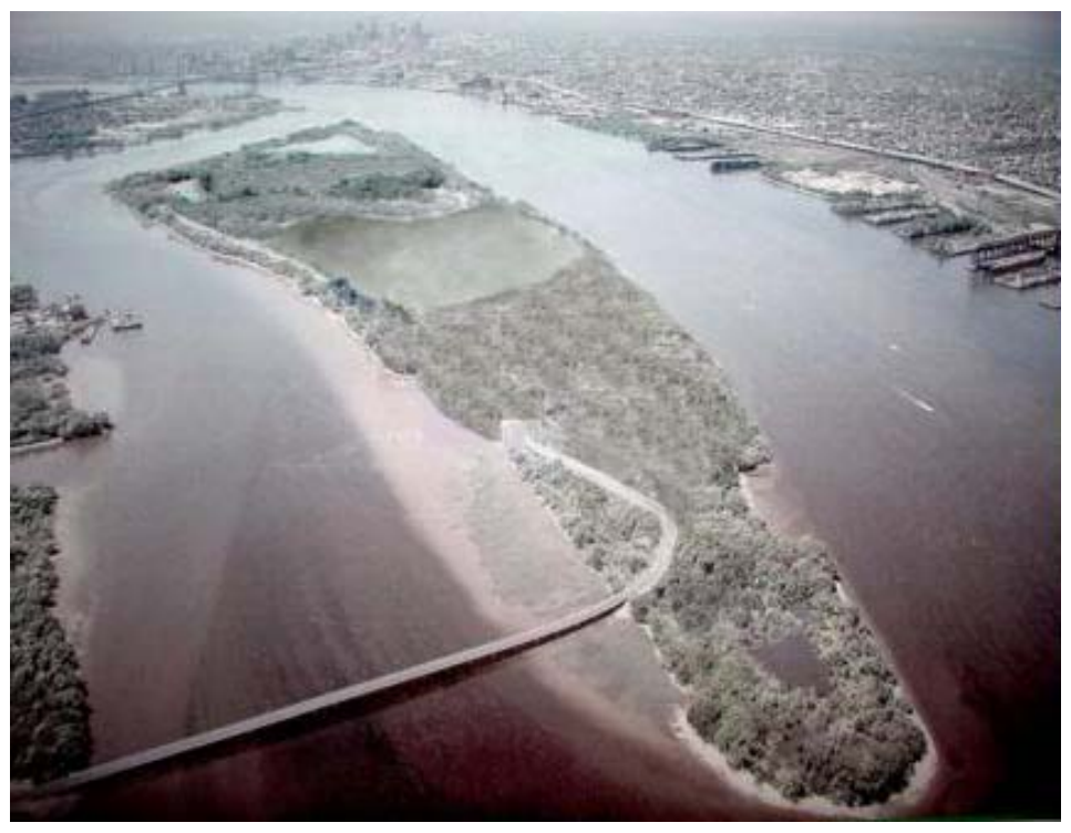
Digitally enhanced image of what Petty's can look like once restored.

Protecting Petty's Island in and of itself is important to the River's health. But, as municipalities throughout South Jersey rediscover their waterfronts and redevelop land once thought to have little value, the redevelopment of Petty's Island could set a dangerous precedent. If NJ's Department of Environmental Protection allows a 400-acre island, home to threatened and endangered species, to be taken for redevelopment, what will they allow along the rest of the River's waterfront?