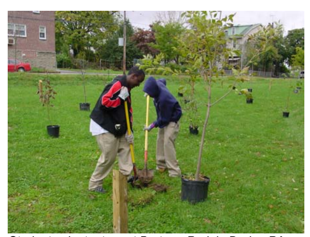
Students plant a tree at Bartram Park in Darby, PA.