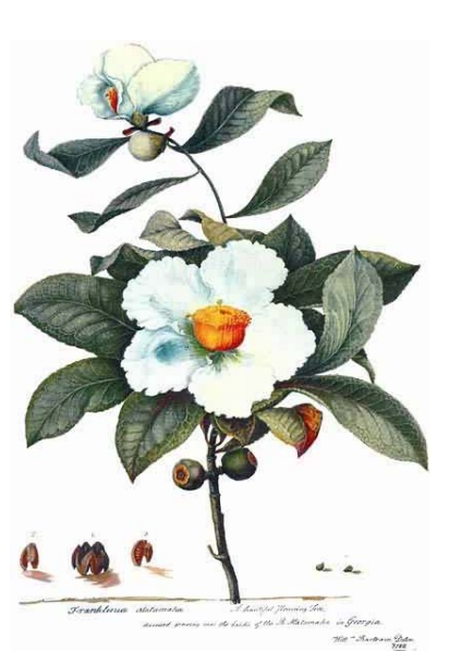
Franklinia alatamaha Marsh. [adapted from W. Bartram, 1788]

Prallsville Mill is conveniently located on Route 29 at the north end of Stockton in the Delaware & Raritan Canal Park, just five minutes north of New Hope, PA and Lambertville, NJ, making a great day trip for out-of-towners. For more information, please call us at 215-369-1188.