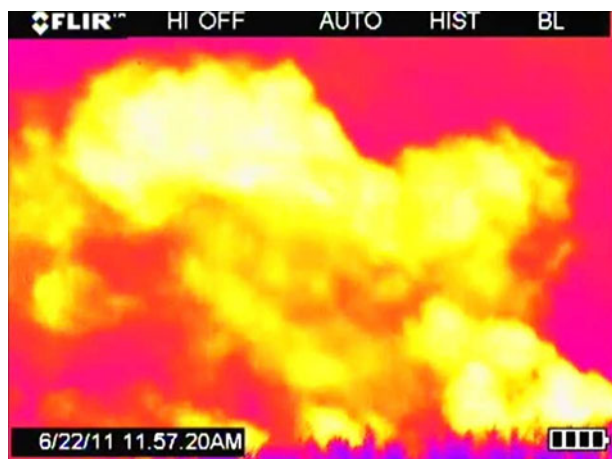
Fig. 1 Venting of natural gas into the atmosphere at the time of well completion and flowback following hydraulic fracturing of a well in Susquehanna County, PA, on June 22, 2011. Note that this gas is being vented, not flared or burned, and the color of the image is to enhance the IR image of this methane-tuned FLIR imagery. The full video of this event is available at http://www.psehealthyenergy.org/resources/view/198782 .

Cathles et al. state with regard to our paper: “The data they cite to support their contention that fugitive methane emissions from unconventional gas production is [sic] significantly greater than that from conventional gas production are actually estimates of gas emissions that were captured for sale. The authors implicitly assume that capture (or even flaring) is rare, and that the gas captured in the references they cite is normally vented directly into the atmosphere.” We did indeed use data on captured gas as a surrogate for vented emissions, similar to such interpretation by EPA (2010). Although most flowback gas appears to be vented and not captured (EPA 2011b), we are aware of no data on the rate of venting, and industry apparently does not usually measure or estimate the gas that is vented during flowback. Our assumption (and that of EPA 2010) is that the rate of gas flow is the same during flowback, whether vented or captured. Most of the data we used were reported to the EPA as part of their “green completions” program, and they provide some of the very few publicly available quantitative estimates of methane flows at the time of flowback. Note that the estimates we published in Howarth et al. (2011) for emissions at the time of well completion for shale gas could be reduced by 15%, to account for the estimated average percentage of gas that is not vented but