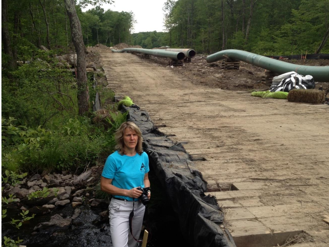
Delaware Riverkeeper Network Documents Pipeline Construction Activity in the Delaware River Basin