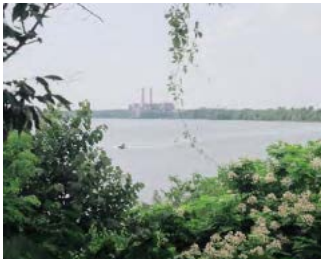
INDUSTRIAL TOWERS IN THE BACKGROUND OF A SCENIC RIVER VIEW.

Other industries that today rely on Delaware River surface water include steel manufacturing, chemical companies, paper mills, cement production facilities, and oil refineries. Chemicals are manufactured at DuPont with locations in New Jersey and Delaware. Although clean water is an essential component of DuPont's operations, DuPont's Chamber Works facility in Deepwater New Jersey is the single largest discharger of hazardous waste effluent in New Jersey. 311 Industries like this do not help the River or region, but actually hurt the long term growth of the environment and economy. Rohm and Haas (now Dow Chemical) is a chemical company based out of Philadelphia. According to the industry, chemical manufacturing and research requires a reliable water source: "Water is the single most important chemical compound". 312 The higher the level of initial contamination of the water, the more effort that must be applied before research and production can begin.