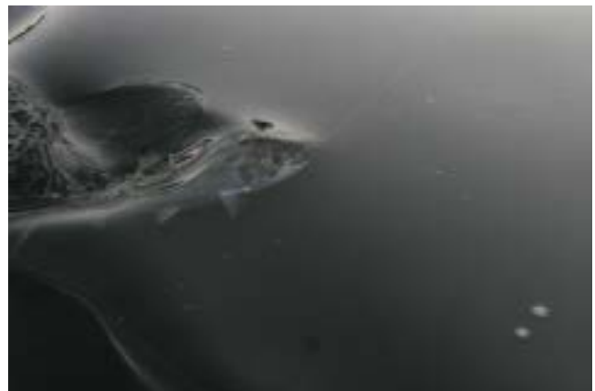
SHAD ARE MAKING THEIR WAY BACK UP THE DELAWARE AND ITS TRIBUTARIES AGAIN BECAUSE CLEAN WATER IS ALLOWING THEM TO RETURN TO THEIR SPAWNING GROUNDS AFTER A LIFE IN THE ATLANTIC OCEAN.

By the mid-20 th century, a combination of an increasing human population, loss of natural forest wetlands, and inadequate sewage and industrial waste treatment created an ecological barrier, a 20-mile oxygen dead zone that impeded the ability of fish to migrate upriver to spawn in the Philadelphia/Camden portion of the River. 260 Improved technologies and laws that required their use, including the Federal Clean Water Act of 1972, forced the cleanup of a variety of pollution sources to the River. As a result, the nutrient pollution which was the primary cause of the River's oxygen problem was largely abated, allowing fish to once again migrate upstream from the ocean and lower stretches of the estuary.