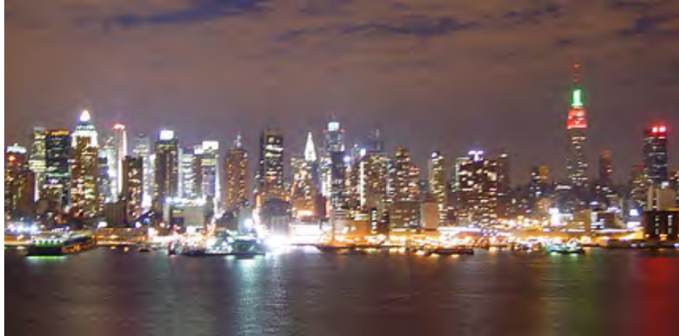
NEW YORK CITY DECIDED TO PRESERVE RIPARIAN LAND IN THE UPPER DELAWARE TO MAINTAIN CLEAN WATER VS. BUILDING A MULT- BILLION WATER FILTRATION PLANT.

Agreement in 2007. The Watershed Plan that was created invested in protecting riparian buffer zones and watershed lands around their City's reservoirs in order to help protect their water source from non-point source pollution, including nutrients and pesticides resulting from stormwater runoff, septic tanks and agriculture. 293 The City invested in repairing and installing community sewage treatment plants throughout the counties that drain to their reservoirs. Protecting the watershed was estimated to only cost the City around $1 to $1.5 billion dollars with $250 million invested in acquiring land and setting aside special protection areas. 294 This land purchase has been complemented by regulatory protections (New York City's Rules and Regulations for the Protection from Contamination, Degradation, and Pollution of the NYC Water Supply and its sources Chapter 18 and landowner incentives for land protection. 295