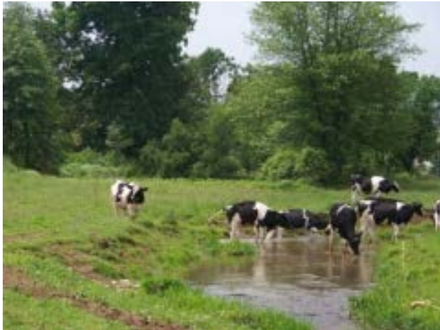
WITHOUT FENCING, EVEN SMALL ANIMAL OPERATIONS CAN DEGRADE STREAM QUALITY.

And agriculture must take due care to ensure that it does not itself become a source of pollution to waterways in the watershed. Animal agriculture produces byproducts like manure and chemical waste that should be properly treated, recycled as fertilizer or compost and kept away from waterways. Rain washes livestock waste containing bacteria and pathogens into water sources. Excessive nutrients from animal byproducts destroy river habitats by creating excessive algal blooms resulting in reduced oxygen levels that suffocate fish and impact wildlife. Livestock should always be kept away from streams and rivers.