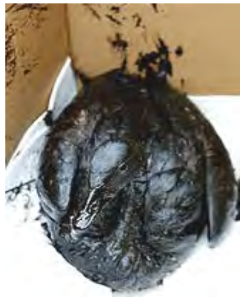
ABOVE LEFT: AFTER THE ATHOS I OIL SPILL TEAMS FROM ALL OVER THE REGION TOOK PART IN THE CLEAN UP EFFORTS TO WASH BIRDS AND STOP THE FLOW OF OIL FROM THE SPILL SITE. PHOTO CREDIT: DAVID SWANSON PHILADELPHIA INQUIRER: ABOVE RIGHT: ATHOS I PHOTO CREDIT: DANIELLE DEMARINO BOTTOM RIGHT: OIL SOAKED GOOSE FROM ATHOS 1 SPILL PHOTO CREDIT: DAN PRAN/THE NEW YORK TIMES