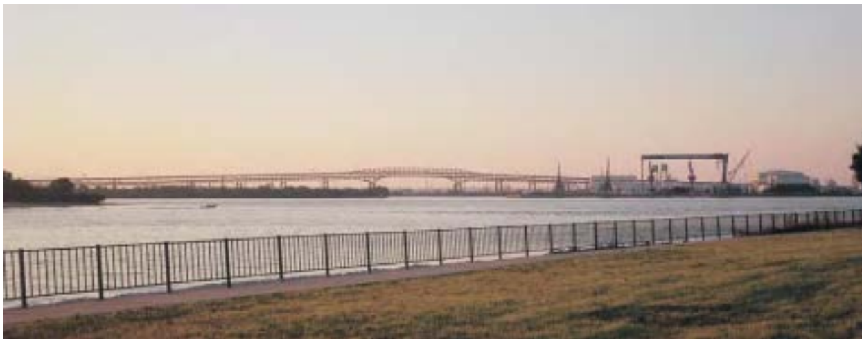
VIEW OF THE NAVY SHIPYARD AT SUNSET. THE PORTS ARE SHIPPING AND RECEIVING CORRIDORS FOR INTERNATIONAL TRADE AND COMMERCE. MOSTLY OIL TANKERS, WE ALSO RECEIVE PERISHABLE FOODS AND CONSUMER GOODS.

A deepened main navigation channel is not needed to support this vibrant port, or new business. The success of the Delaware River ports lies in developing them as a strong niche port. In recent years record growth has been reported for the Delaware River ports, without the prospect of a deepened channel. 325 While deepening the Delaware is not needed for a vital and growing port, it would threaten the other uses of the River with contamination, losing jobs and income, as well as diminishing the health of the River for others, including the people who drink and eat from it.