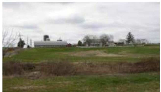
BEDMINSTER, BUCKS COUNTY, PA PRESERVED FARMSTEAD, ONE OF 917 FARMS IN BUCKS COUNTY PRESERVED TO ENSURE THE RURAL HERITAGE AND FARMING TRADITIONS OF THE REGION.

There are thousands of farms throughout the basin providing local restaurants and farm markets with an abundance of local produce, vegetables, grass-fed meat, eggs, dairy products, and more. In New Jersey, "Jersey Fresh" has become emblematic of family farming and marketing throughout the state. Water provided by the Delaware River system and the