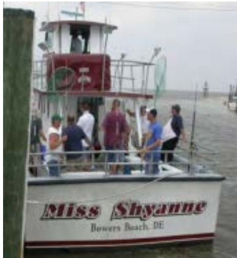
BOWERS BEACH, DE RUSSELL'S CHARTER FISHING BOAT MISS SHYANNE TAKES A GROUP OUT ON A FISHING TOUR ON THE DELAWARE.