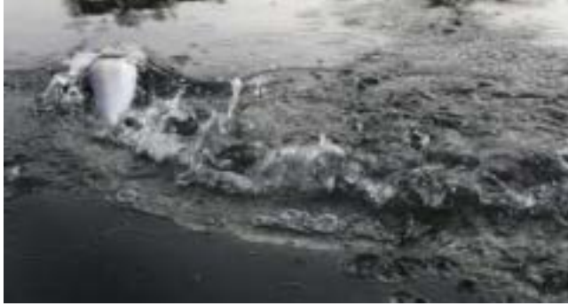
SHAD FISHING: LUMBERVILLE, PA PHOTO CREDIT: ART EASTON 2008

Today, a viable commercial fishery is still maintained along the Delaware River and Bay. In 1998, statewide, New Jersey's commercial fisheries harvested 196 million pounds at a value of $90.9 million statewide; New York harvested 57.5 million pounds at a value of $84.3 million; and Delaware harvested 7.8 million pounds at a value of $5.6 million. 261 According to New Jersey's Department of Fish and Wildlife, efforts to clean up rivers and reservoirs have created the best trout fishery New Jersey has ever had. 262 Striped Bass has been declared recovered in the Delaware River by the Atlantic States Marine Fisheries