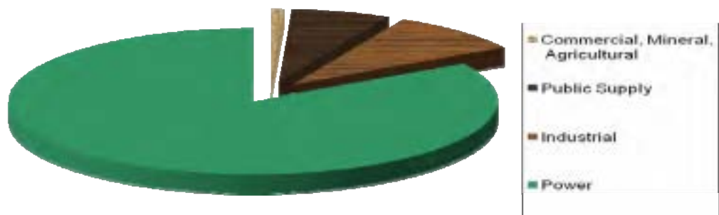
Figure 8: Sectors that Consume Delaware River Surface Water