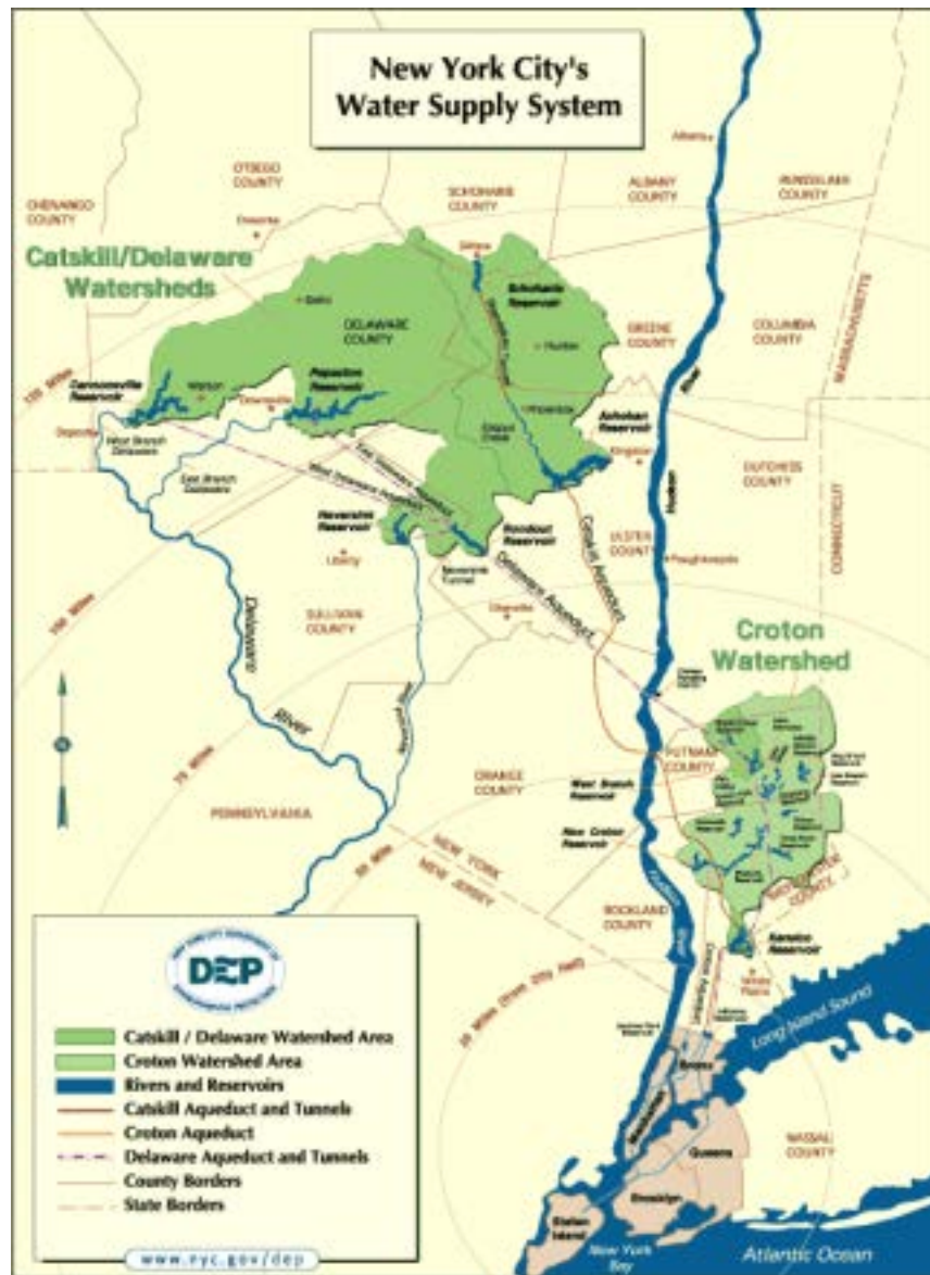
NEW YORK CITY'S WATER SUPPLY SYSTEM

Researchers in other communities recognize the benefits of watershed protection from a community water supply and pollution prevention perspective, finding that every $1 invested in watershed protection could save between $7.50 and $200 in costs for new filtration and water treatment facilities. 297 “In 1991, the cost of treating contaminated water was estimated to be $10-$15 per month for a family of three.” 298 Communities in Washington D.C. spend as much as $3 to $5 per pound to remove nitrogen from wastewater, a process that forested buffers provide naturally. 299