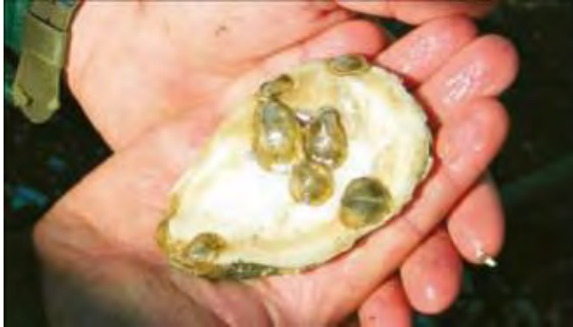
OYSTER LARVAE REQUIRE A CLEAN, HARD SURFACE UPON WHICH THEY CAN ATTACH OR "RECRUIT." DUE TO A STORAGE OF THESE NATURAL RESOURCES, THE DELAWARE BAY OYSTER RESTORATION TASK FORCE HAS "PLANTED" SURF CLAM, OCEAN QUAHOG, AND MARYLAND OYSTER SHELL IN AN EFFORT TO REVITALIZE THE DELAWARE BAY OYSTER POLLUTION.

Bay. 274 In 2006 it was reported that oyster harvesting generated $535,000 of income for harvesters, and a total $3 million of economic benefit locally. 275 Numbers of oysters and successful shell placement and economic benefits continue to markedly increase. The estimated overall economic impact to the industry for 2007 is estimated at $90 million. 276