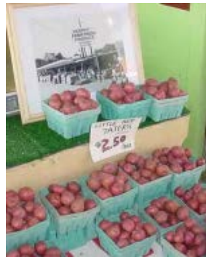
JERSEY FRESH RED POTATOES SOLD IN SALEM COUNTY FOR $2.50 A BOX

Current methods of irrigation take in water from the River and apply it directly onto agricultural fields. Many agricultural fields use ground water wells for irrigation rather than direct surface water intakes, but contamination can still happen. The importance of clean water in irrigation was proven in the fall of 2006 when over one hundred people became sick after consuming spinach that was irrigated with contaminated water in California. The irrigation sources were infected from fertilizer runoff and animal waste. 284