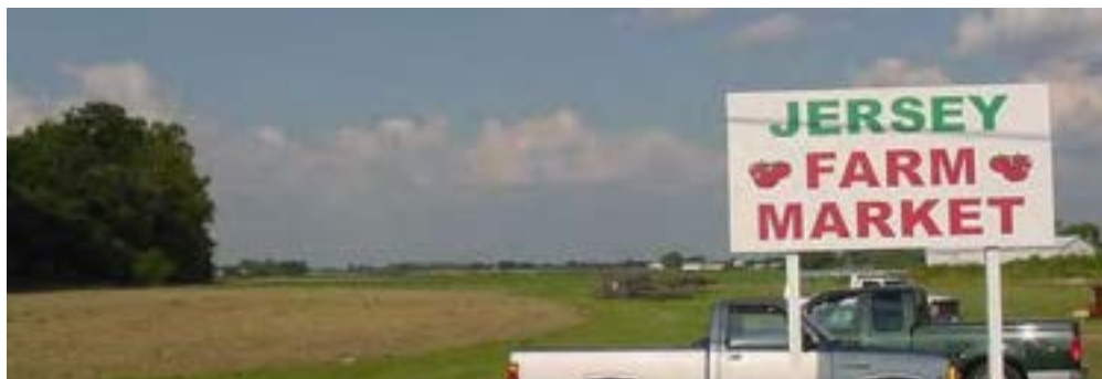
NEW JERSEY FARM MARKET RT 48 SALEM COUNTY. "JERSEY FRESH" HAS BECOME EMBLEMATIC OF NEW JERSEY AGRICULTURE THROUGHOUT THE STATE.