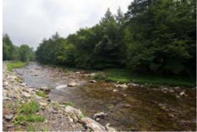
NEVERSINK RIVER, NY THE NORTHERN REACHES OF THE DELAWARE RIVER WATERSHED HELP TO SUPPLY MILLIONS OF NEW YORKERS.

A clean and healthy Delaware River, including the River's corridor, provide for our basic human needs: water, food, safety and health. About 5 percent of the U.S. population or 15 million people rely on the Delaware River for their drinking water supply. Major cities and small communities alike drink from the River.