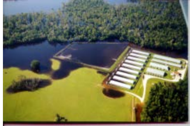
CONFINED ANIMAL FACTORY FARM BEING INUNDATED WITH FLOOD WATERS. THE FARM'S LAGOONS CONTAIN MANURE AND CONTAMINANTS THAT, WHEN FLOODED OR OVERTOPPED, POLLUTE THE NEARBY WATERWAY.

Many livestock and farm animals drink from the water provided by the Delaware River and its tributaries. Clean water is needed in order for them to stay healthy and sanitary. "High levels of sulfates in drinking water can contribute to decreased egg production in chickens." 285 "Many species of animals are susceptible to nitrate poisoning, especially cattle", which has been associated with miscarriage and other reproductive problems, anorexia, lower blood pressure, and reduced lactation for dairy cattle." 286