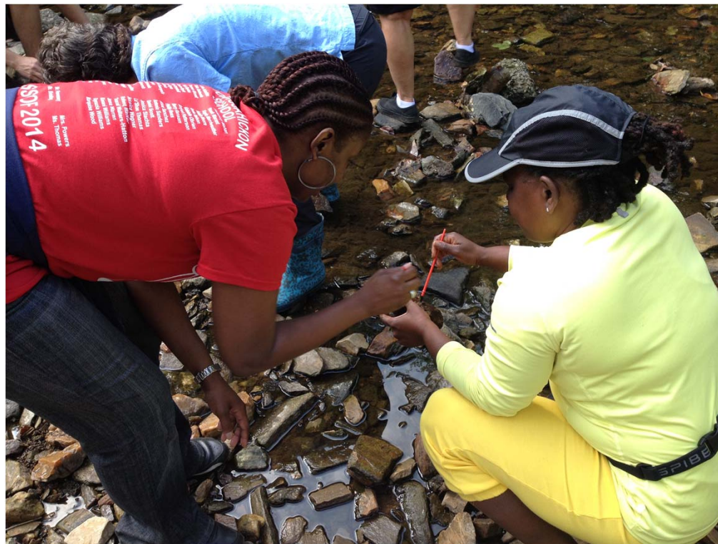
Philadelphia Water FAIRMOUNT WATER WORKS