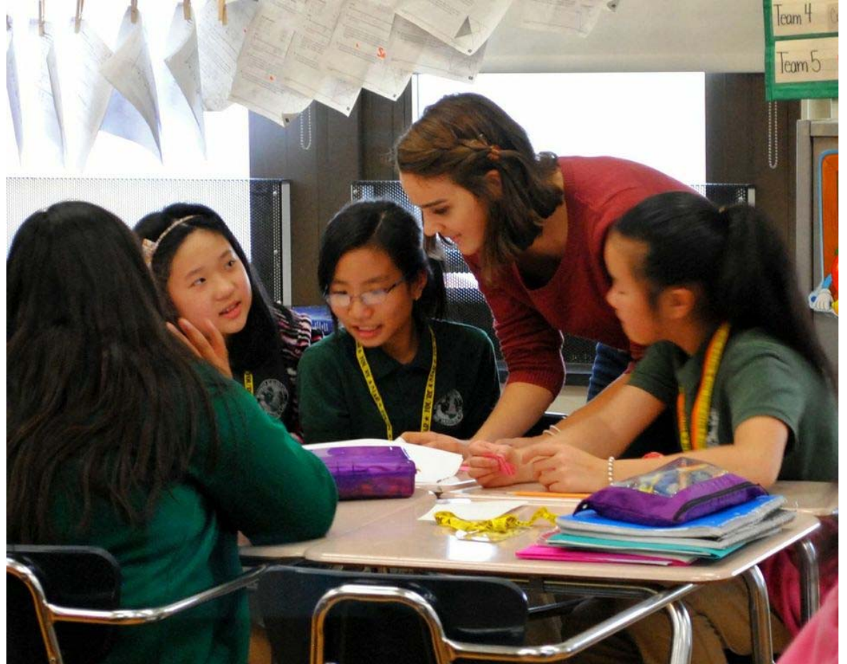
Philadelphia Water FAIRMOUNT WATER WORKS