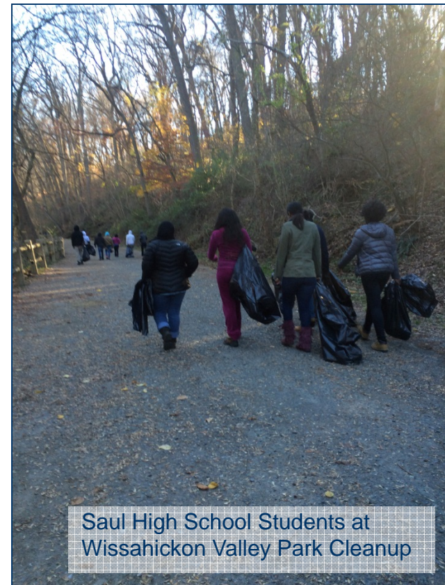
Saul High School Students at Wissahickon Valley Park Cleanup