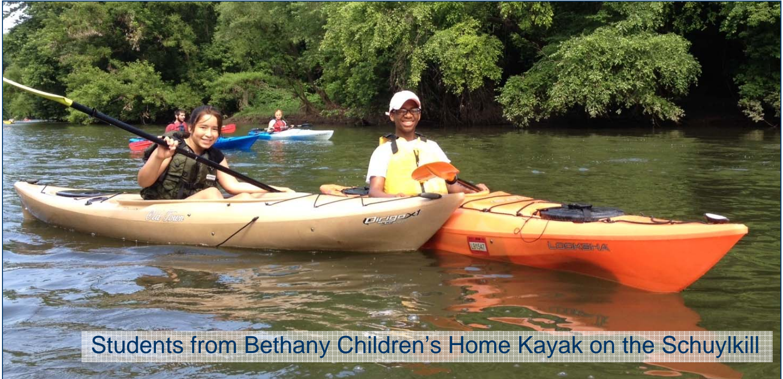
Students from Bethany Children's Home Kayak on the Schuylkill