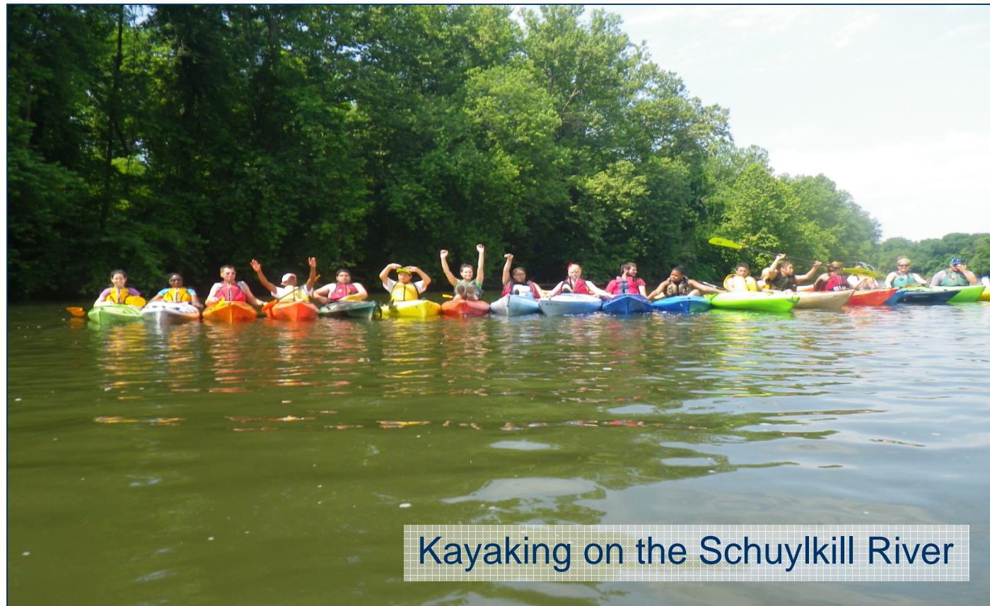
Kayaking on the Schuylkill River