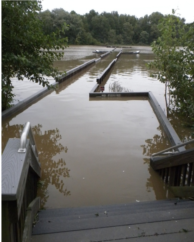
Heinz Refuge, Pedestrian Boardwalk flooded. Hurricane Irene, August 2011.