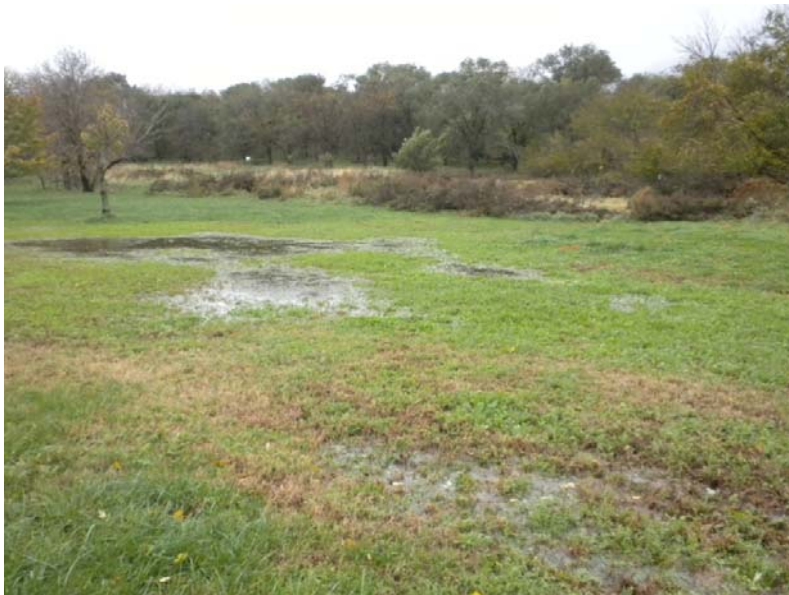
Eastwick residential backyard, Clearview Landfill, Darby Creek behind Landfill. October 2012.

Darby Creek "is one of the country's most flood-prone streams, a significant drain on the National Flood Insurance Program [FEMA], and a national lesson in what can go wrong along a developed waterway." - Philadelphia Inquirer (May 2012)