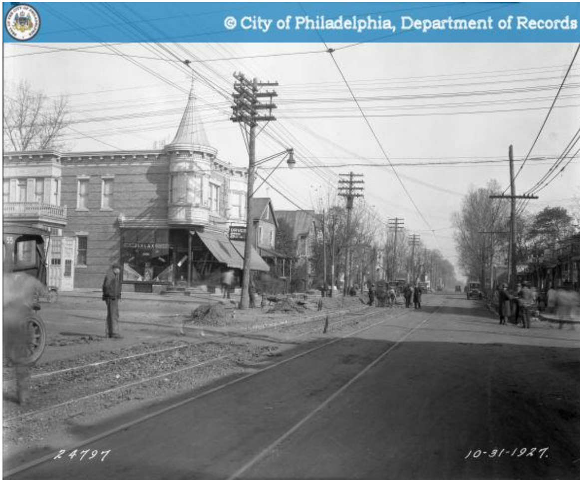
Photo of 88 th Street and Eastwick, Year 1927.

1950's Eastwick: Peaceful, Integrated, Culturally -Diverse.