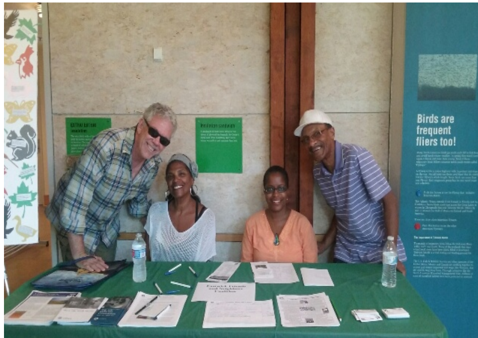
A day of volunteering at John Heinz National Wildlife Refuge.